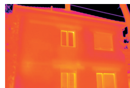
Thermal image without ScaleAssist

Since the temperature scale and coloring of thermal images can be adapted individually, it is possible that the thermal behavior of a building, for example, can be wrongly interpreted. The testo ScaleAssist function solves this problem by adjusting the color distribution of the scale to the interior and exterior temperature of the measurement object and the difference between them. This ensures objectively comparable and error-free thermal images.