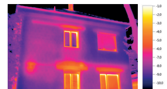
Thermal image with ScaleAssist